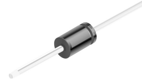
AXIAL LEAD (DO-35) CASE 017AG (Color Band Denotes Cathode)