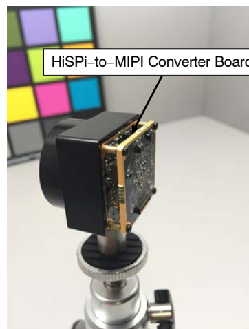
Figure 1. HiSPi-to-MIPI Converter Board Shown Connected to the X-Cube XGS 12000 Imager Board and Installed in the C-Mount Lens Housing