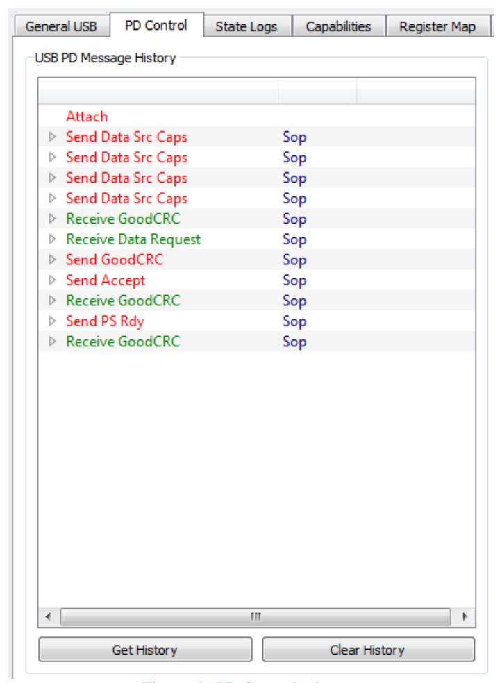
Figure 6 - PD Control tab