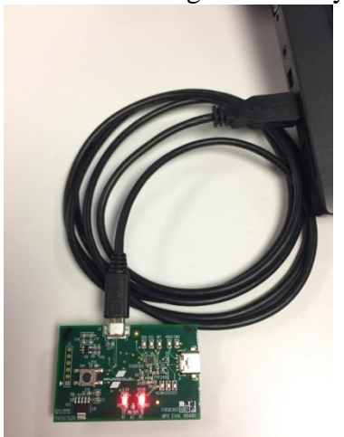
Figure 1 - EVB connected to PC

3. Make sure the EVB is connected and communicating with the GUI as indicated in the status bar on the bottom of the GUI.