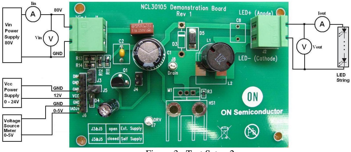
Figure 3 : Test Setup 2

Iadjust Function- Setup 2 Test Procedure: