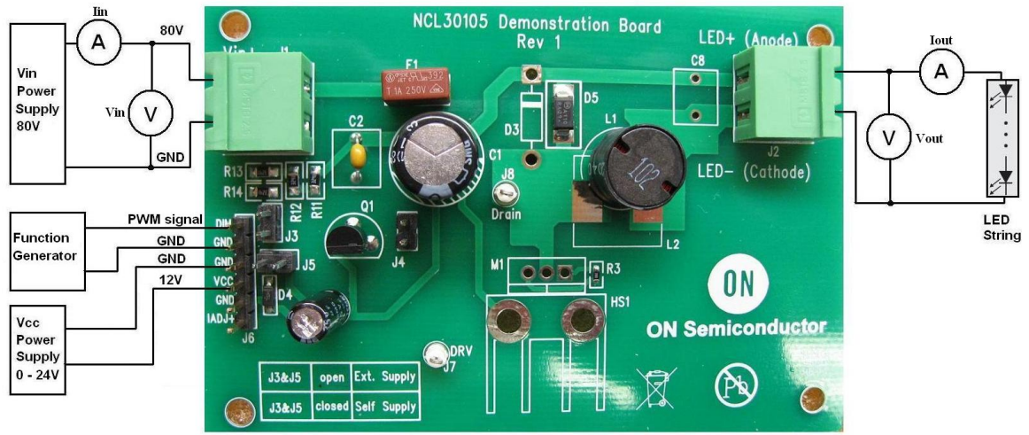
Figure 4 : Test Setup 3

Dimming function- Setup 3 Test Procedure :