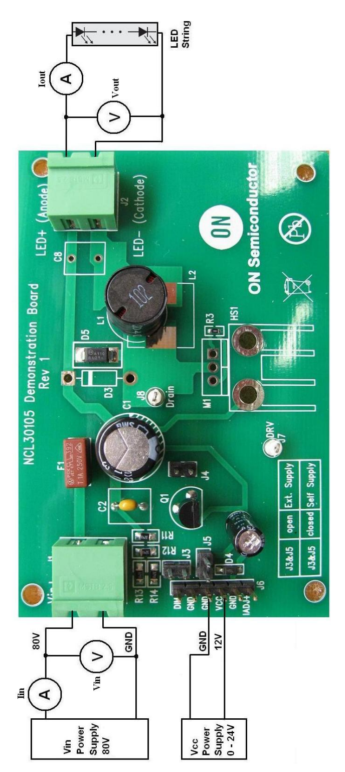
Figure 1 : Test Setup 1

Test Procedure for the NCL30105GEVB Evaluation Board