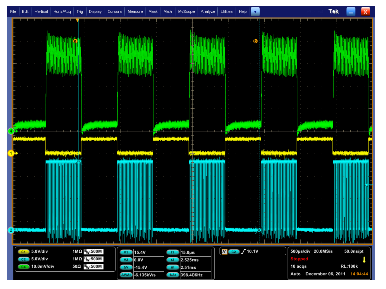
Figure 5 : Test Setup 3 Waveforms