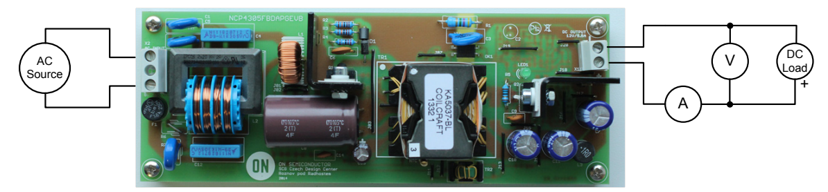
Figure 1: Test Setup

The following steps describe the test procedure for all these boards: