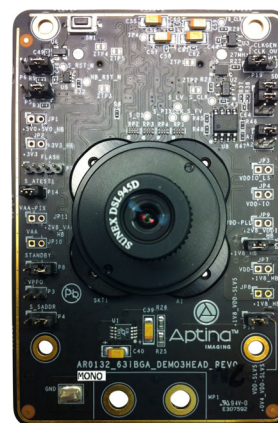
Figure 1. AR0132AT Evaluation Board