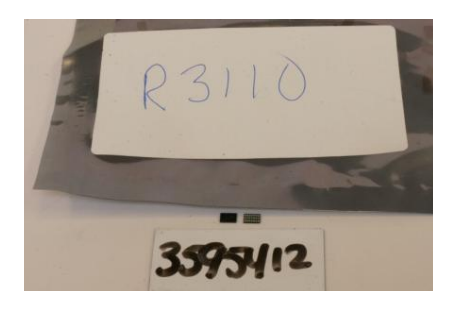
SGS authenticates the photo on the original report only